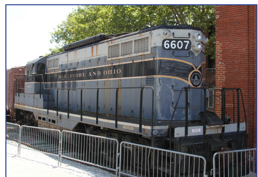
The great outdoors is no friend to railroad preservation. How long will it be before GP-30 No. 6499 looks like the GP-9 No. 6607?