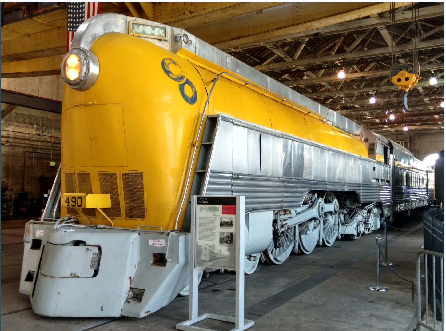
C&O's 1946 streamlined Hudson No. 490 is four years younger than N&W's 611. Readers can be the judge as to which railroad's design team did the better job.