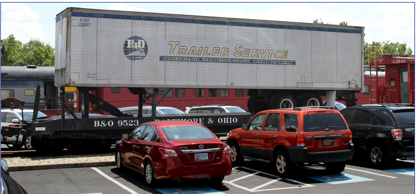
SPACE CONSTRAINTS: Sadly for photographers, some of the classic B&O rolling stock has to be displayed in parking lot medians.