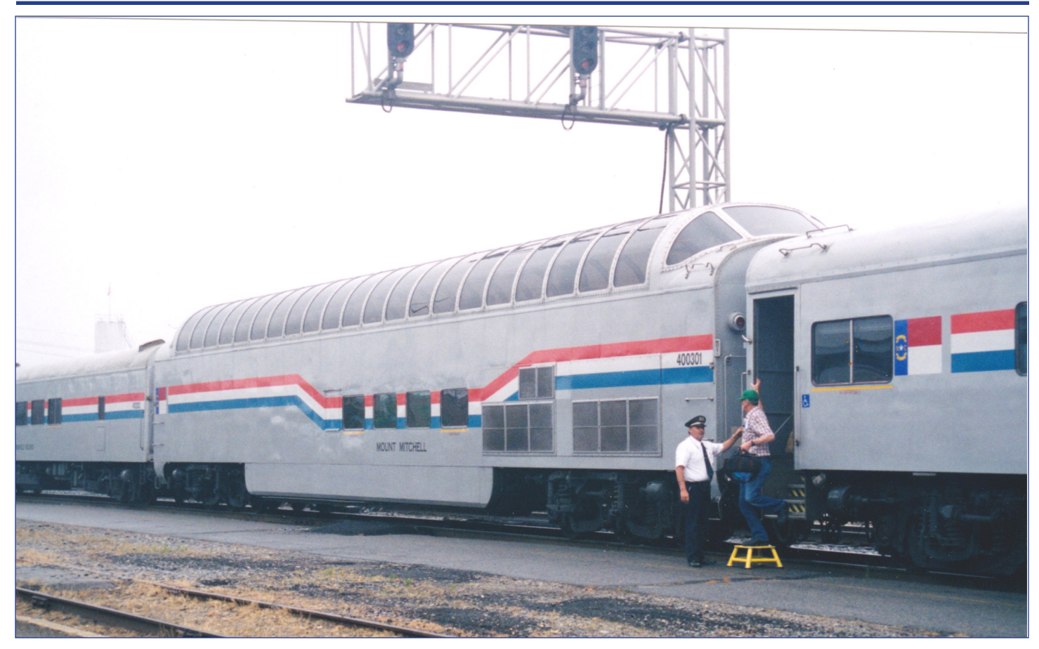
NCDoT's ex-Milwaukee Road "super dome" Mt. Mitchell. First used on the Piedmont in 1999, the car was pulled from service by order of the Federal Railroad Aministration in 2000 due to its lack of emergency windows/exits. With emergency windows installed by NCDoT, the car returned to service in June 2001, only to once again meet the wrath of the FRA. The car's lack of external vestibule doors was deemed as unsafe for passengers, leading to the car's retirement and sale (information via TrainWeb).