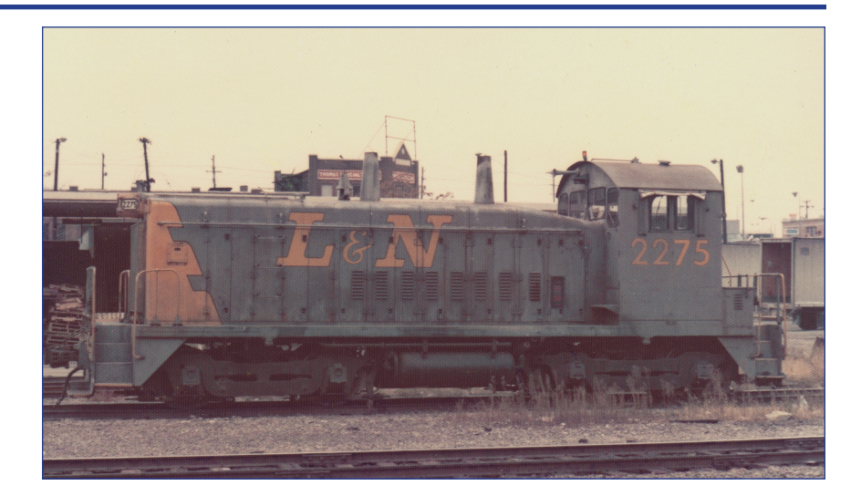
L&N SW-9 No. 2275, was built in 1950.