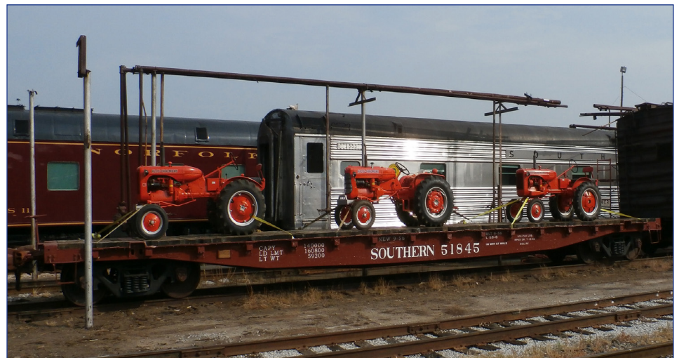
A LOAD WORTHY OF THE EVENT: three Allis Chalmers tractors on a Southern flatcar await service in the event's vintage freight train.