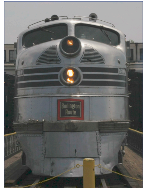
The editor made head-on shots of the Illinois Railroad Museum's CB&Q E-3 (above) and the privately owned MLW FPA-4 ALCo cab operated by the Monticello Railroad Museum.