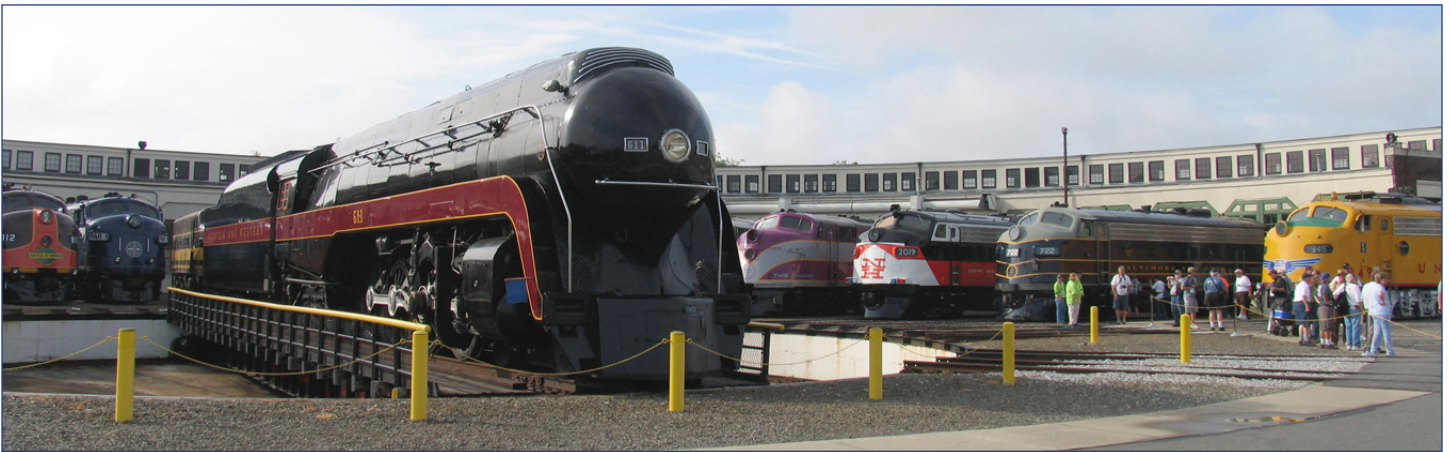
THE QUEEN AND HER COURT: N&W 611 is the sole streamlined steam locomotive at the event: 611 is to spend the next nine months at Spencer for her rebuild for the Norfolk Southern steam program.