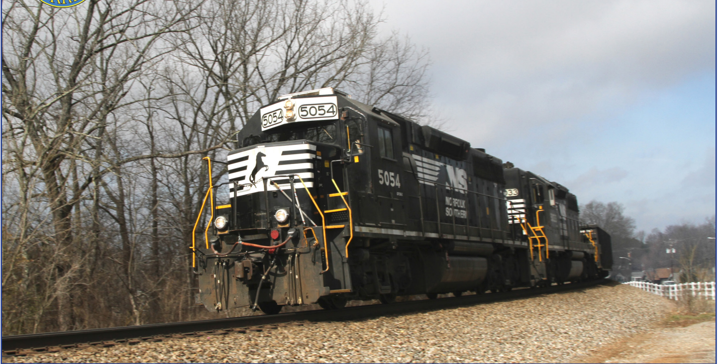
A wave from eastbound GP-38-2 #5054 in Conover, Tuesday March 3, 2015