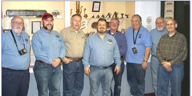
Eight of the eleven members of the Southbound Model Railroaders who visited the P&W on March 7 are captured above. At left is their club building in Southfork Park, located on Tipperary Lane just off of Country Club Road in Winston-Salem. Below is their beautiful model of Winston-Salem’s circa 1926 Union Station.