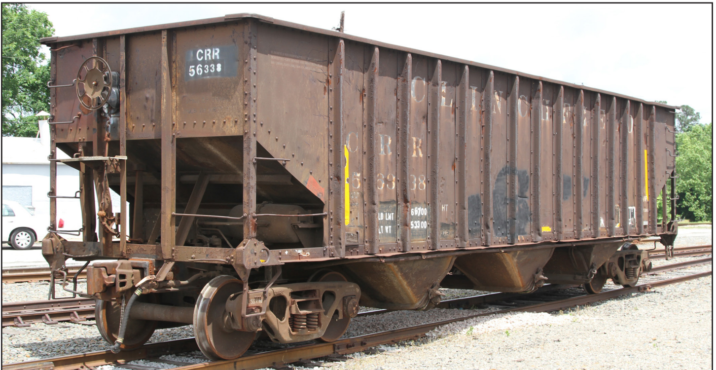
For our Clinchfield fans: former CRR hopper No. 56338 rests in the NCTM yard on May 14.