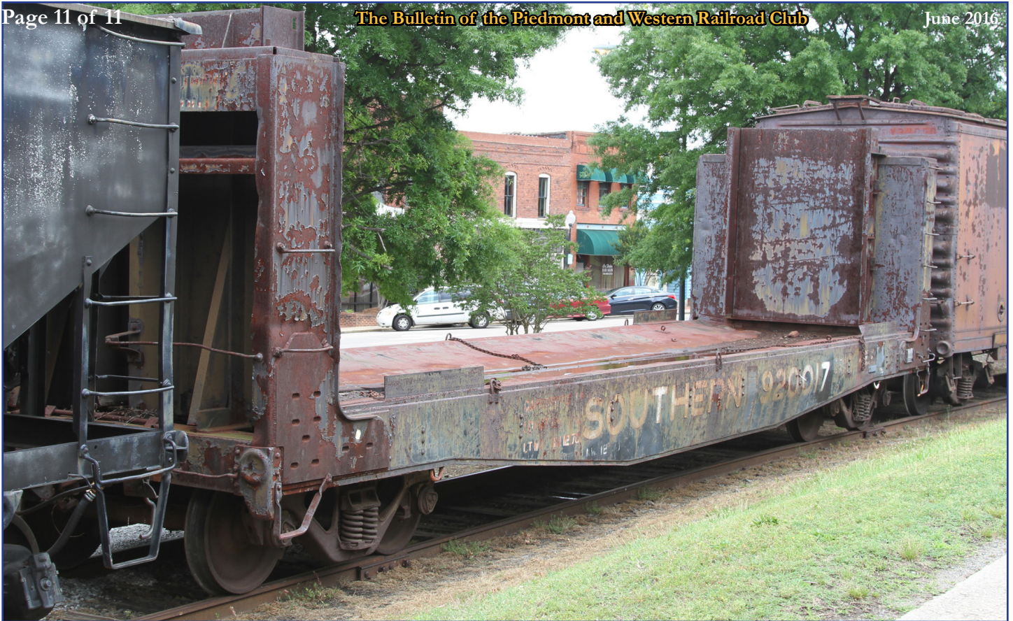
The Southern converted this former pulpwood car into 920017, a panel track car for wreck train service. The ends of half a dozen pre-built track sections rested in the cradles welded to the car's bulkheads.