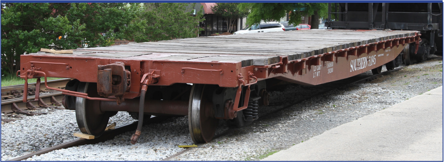
Southern 51845 is a 53' 6" inch flat car built in September of 1956.