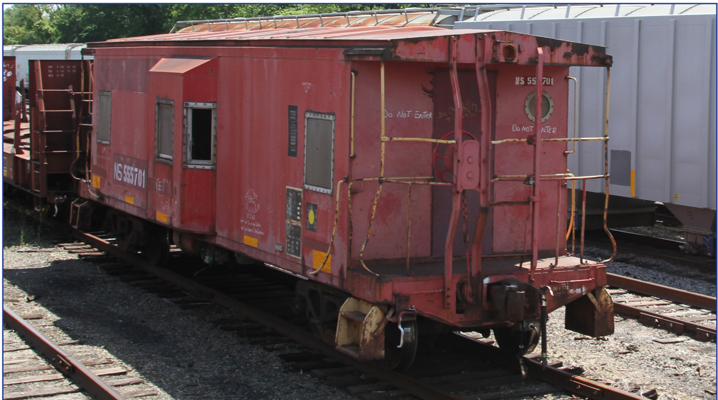
With NCTM's X648 in an awkward spot for photographs, the editor used a cab-ride on 6133 to shoot an ex-SRY caboose still active on the Norfolk Southern. Former X406 now serves as "shoving" platform No.7555701 for trainmen on the Salisbury locals. A former N&W cupola caboose, NS 555672 shares that duty for runs that involve shoving cars for a mile or more.