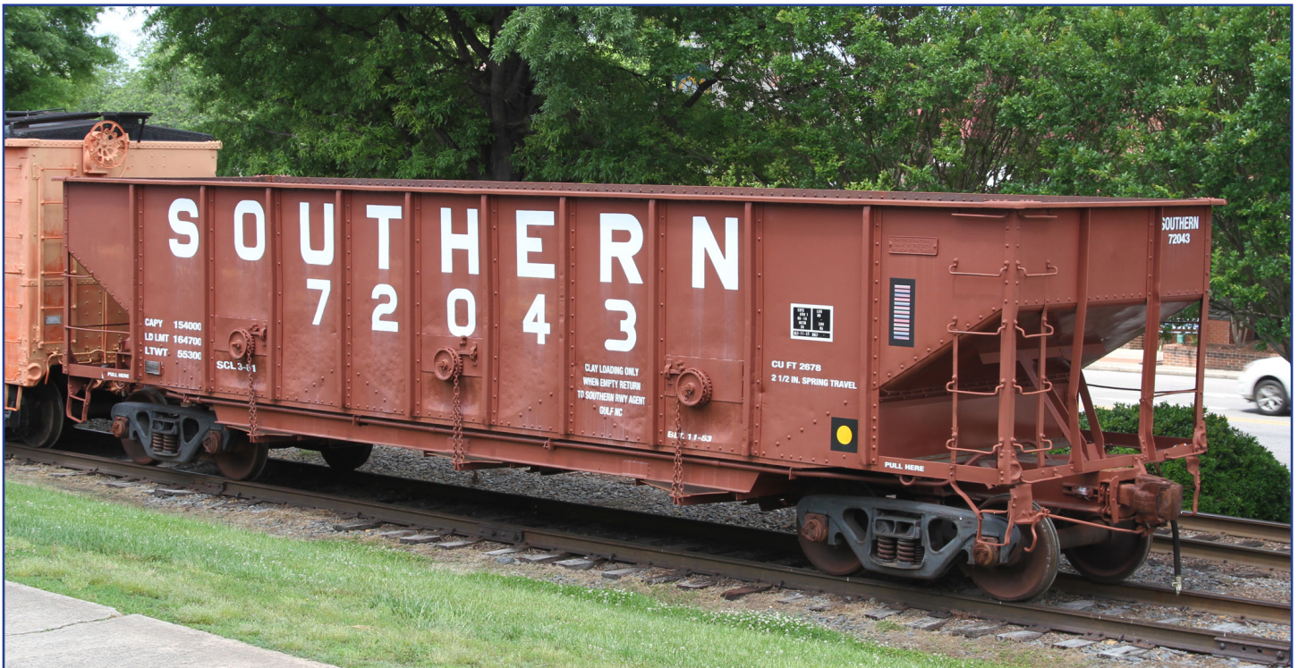
Originally built in 1953 as a three-bay coal car, 72043 was rebuilt by the Southern with drop bottom doors for clay hauling service for the North Carolina’s brick industry.