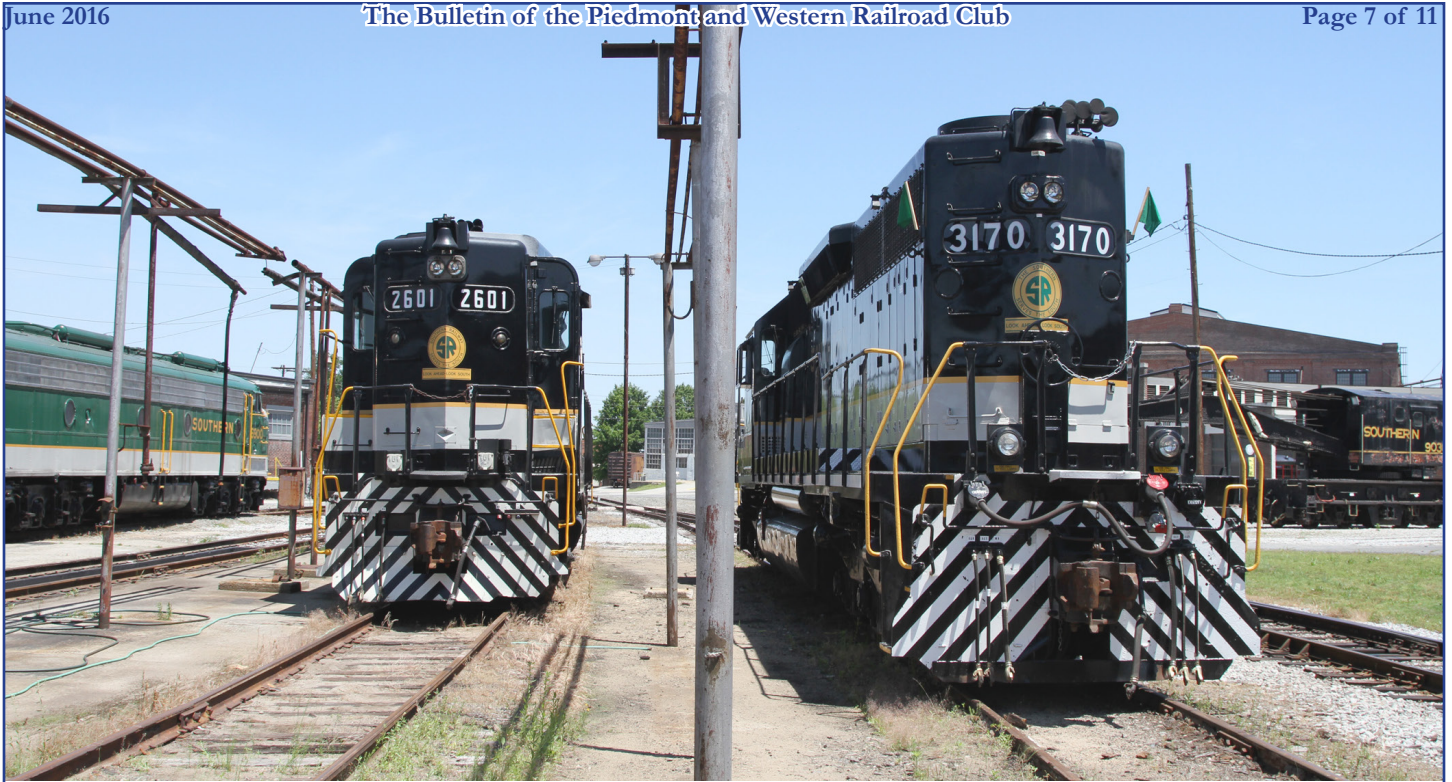
2601 and 3170 pose nose-first on the former sanding tracks- the GP-30 being an exception to Southern's usual long-hood as the front specification.