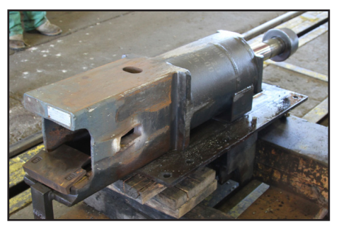
...to be replaced with a suitable new unit.