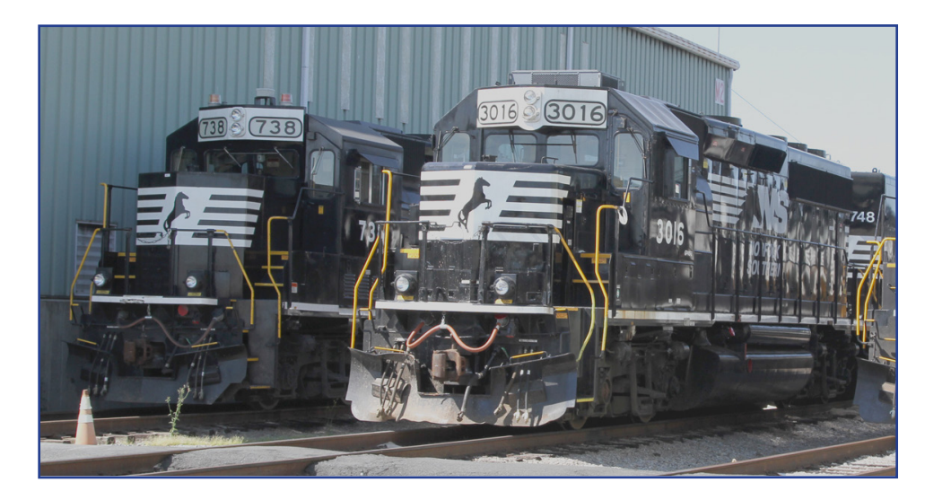
Remote control RP-E4C slug No.738 started life as a high-nose Southern GP-50 No. 7067 (5/1980). GP-40-2 No. 3016 began its life as Conrail No. 3305 (5/1977).