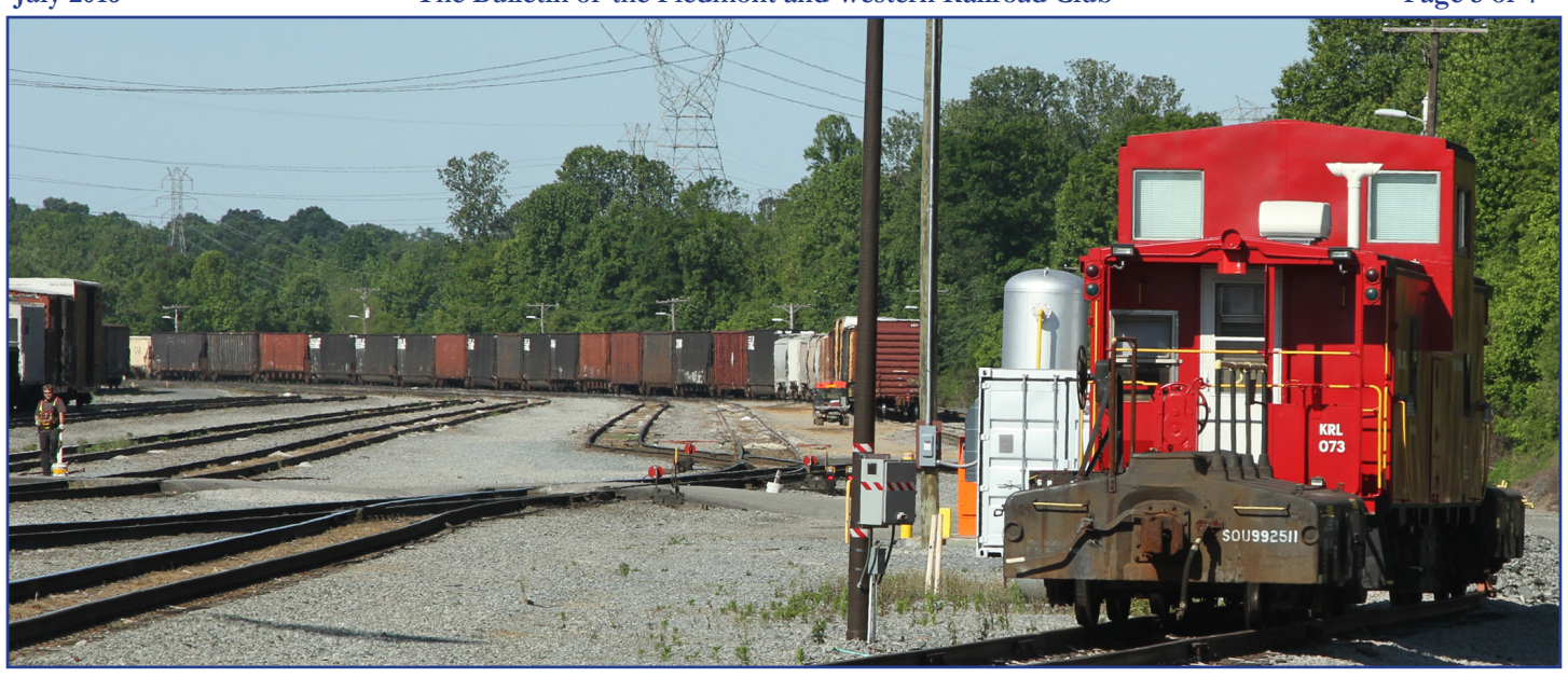
CONTRASTS: At the far left, an NS conductor operates an out of the view remote-controlled slug/locomotive set on one of the yard's pull back tracks while a vintage ex-Southern scale test car sits behind Kasgro Rail Line caboose No. 73. New Castle, Pennsylvania-based Kasgro operates a fleet of over 440 specialized heavy duty flats and depressed-center cars; their cabooses accompany special movements of their cars.