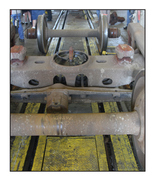
FOAMER NOTE 2: Note that this car has truck mounted air brakes, said to be more complicated to maintain.