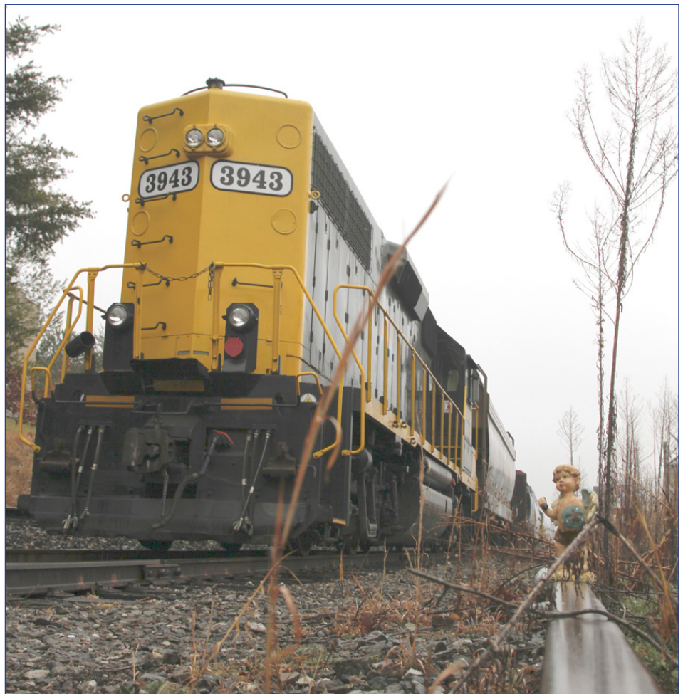
LOOK HOMEWARD ANGEL? Arden is a few miles away from Tom Wolfe's old stomping grounds in Asheville, but a plastic cherub sitting on a unused rail seems right at home. Editor's note: this shot was unstaged: the angel was an apparent refugee from a neighboring business's trash pile.