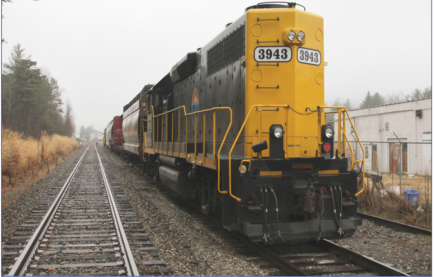
The P&W visits the Blue Ridge Southern Railroad- see page 3.