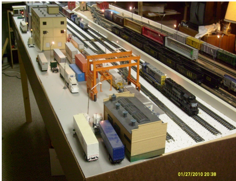
What kept the editor busy while being snowed in.