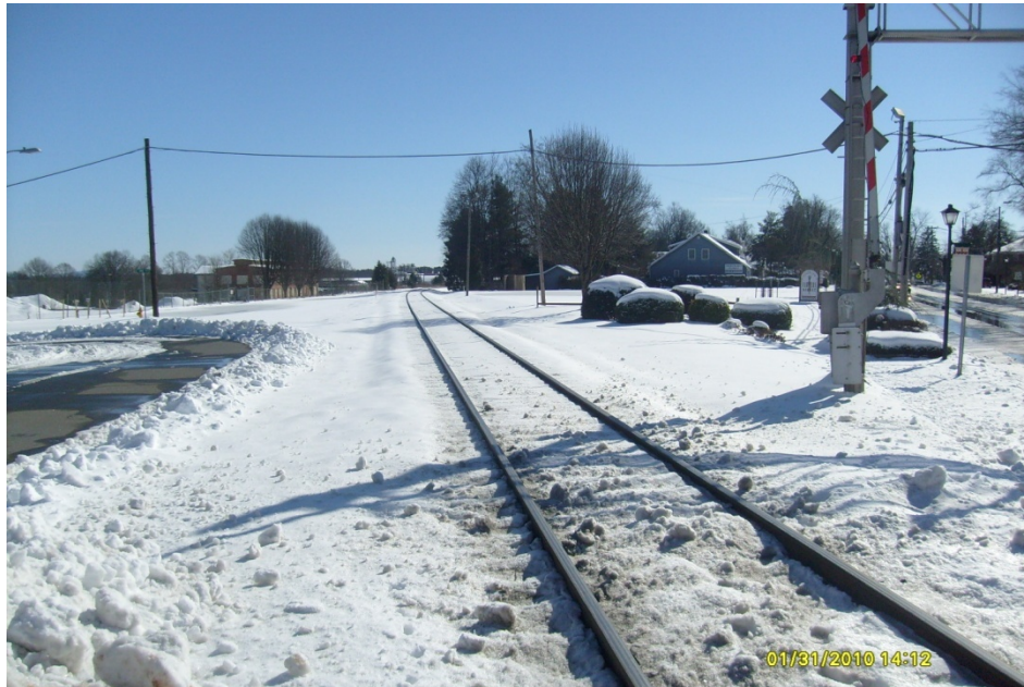
A COLD day to be railfanning in Conover!